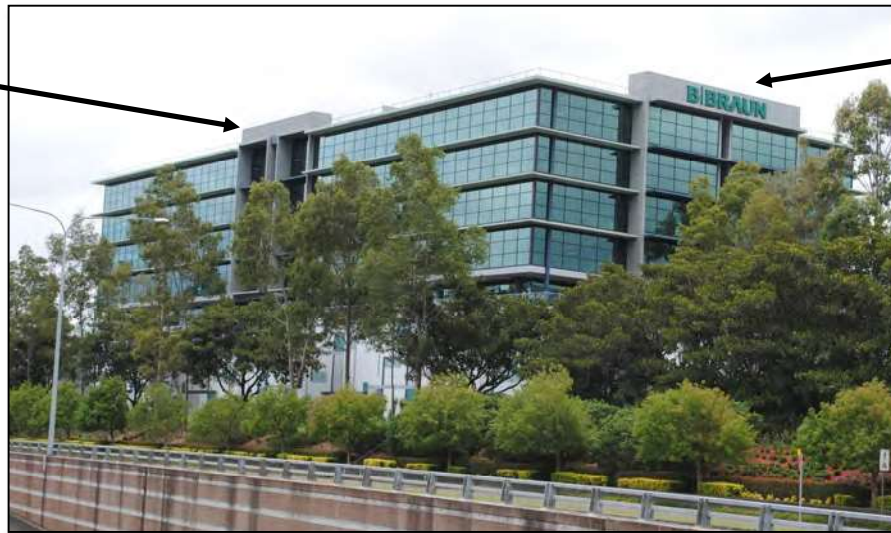
Signage South Façade— Old Windsor Rd & Lexington Drive view

Note: Each sign is to be a maximum size of 15m2, centrally located.