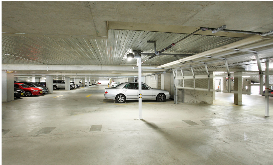
Security Controlled Parking

Access to lift lobby areas is direct and secure.