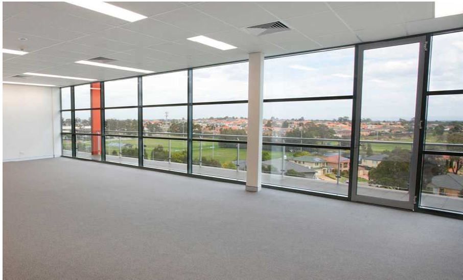
Outlook from Level 4 Office