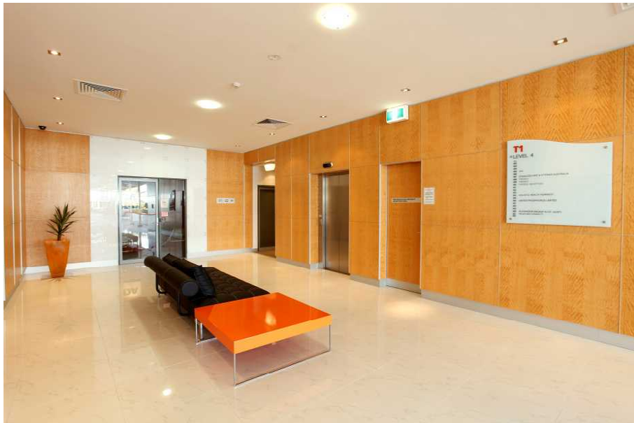
Level 4 Foyer